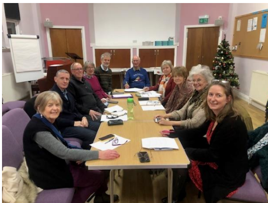
Milngavie in Bloom Committee December 2022